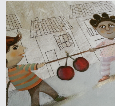
Fleur used for illustration. (Chiara Bolometti)