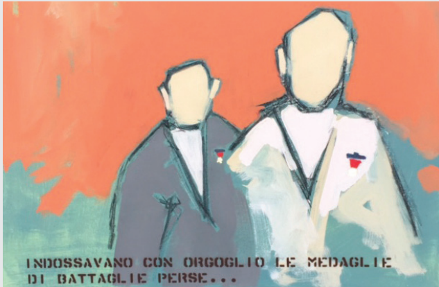
Fleur used on wood. (Jack Quick)

If you look at an object painted with Fleur, you do not see a flat, "synthetic" mattness, but rather diffused light. You have the visual sensation of sinking into the colour and the final effect is very natural.