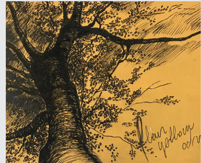
Fleur used as ground for Indian ink on rubber. (Mara Apostoli)