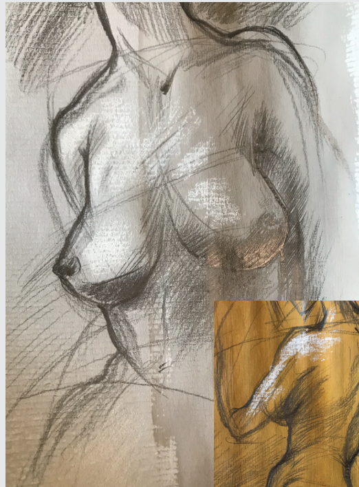
Fleur used as ground for pencil and coloured pencil on paper. (Mara Apostoli)