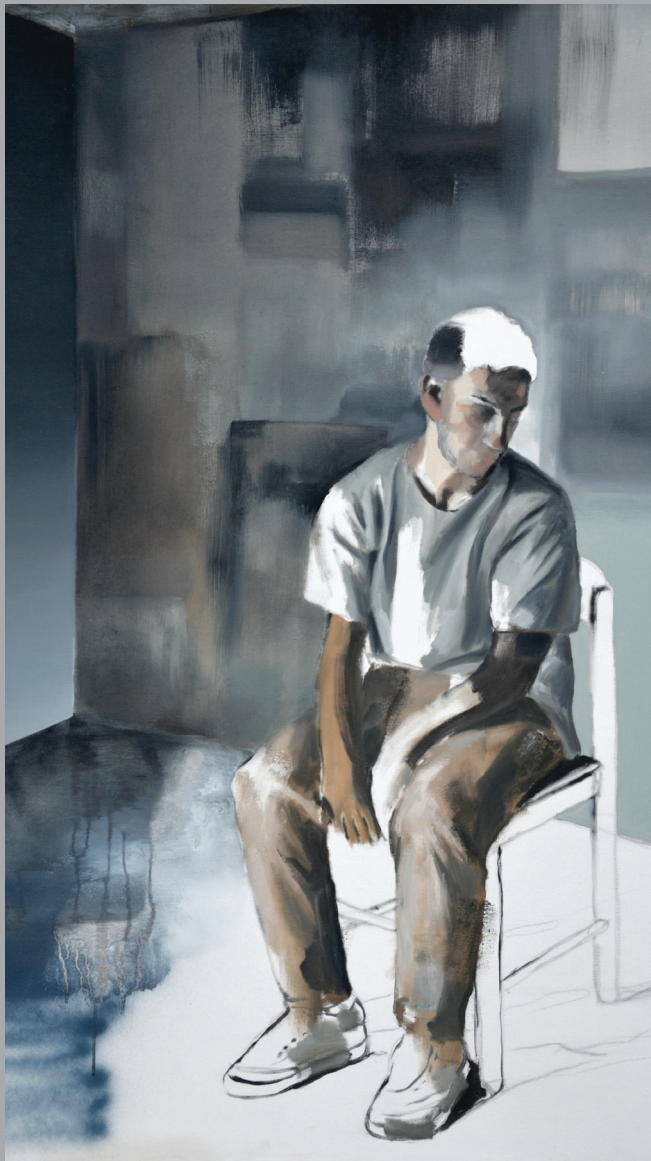
Fleur used on canvas. (Lorenzo Ermini)