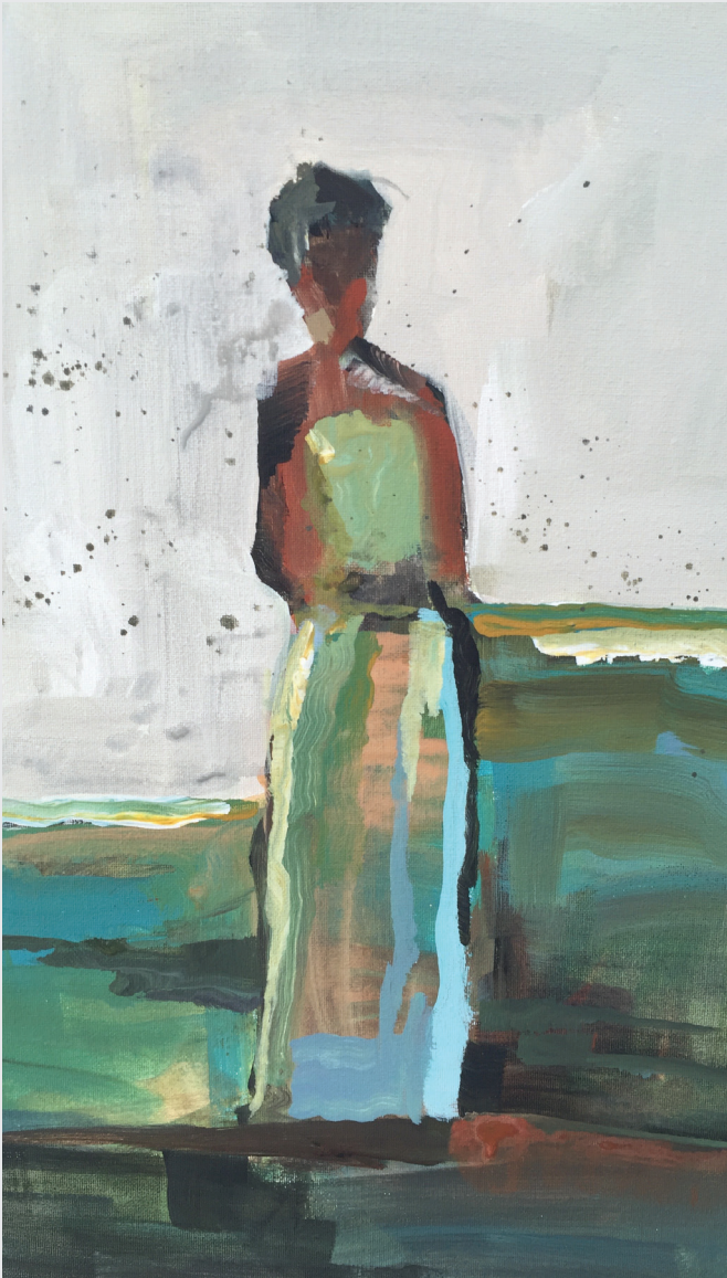
Painting on canvas made with Fleur.

Furthermore, thanks to its extreme versatility artists can use it on any surface, mixing and matching it with several mediums, according to their preferences and needs: liquid paint, sprays and markers. Our line also includes many mediums developed in collaboration with artists for artistic uses.