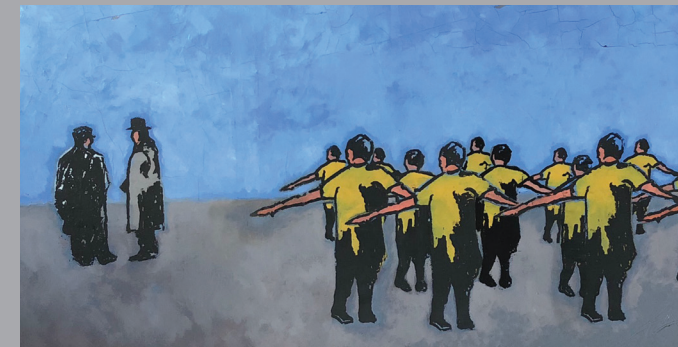
Fleur used for screen printing. (Jack Quick)

Fleur Paint originates from 70 years of experience in the production of paint for restoration, which was traditionally used to restore historical paintings, frescos and all kinds of artworks.